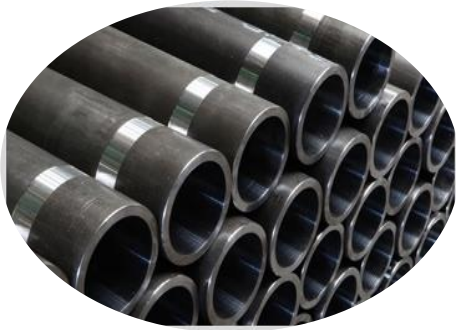
CASING IN CARBON STEEL