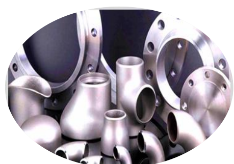
PIPE FITTINGS FLANGES